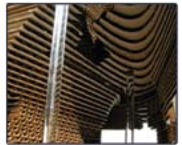
› architecture project was completed with laser system

To learn how a Universal laser system can help give you the competitive edge, call 866-727-7256 or visit www.engraversnetwork.com .