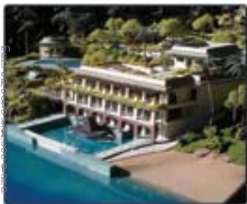
› front of house and pool enclosure were laser cut