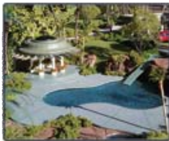
› entire gazebo was laser cut