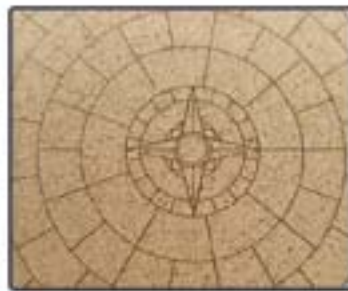
› brickwork was laser engraved on plastic and painted